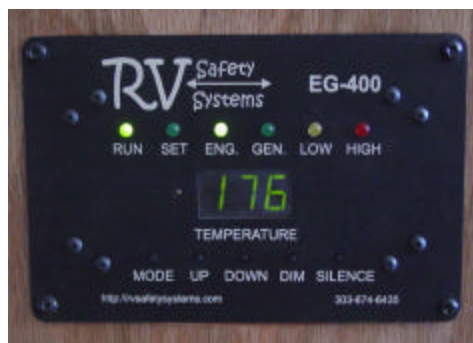
EG-400 Engine and Generator Fire Detection System

Update, January 2005. The Fire detection system noted above has been in the beta test phase for several months and will be in the manufacturing phase by spring of 2005. For more information go to: http://rvsafetysystems.com